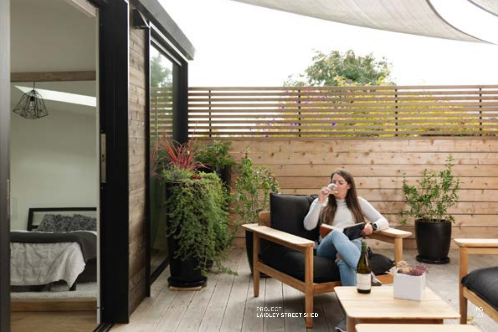
PROJECT LAIDLEY STREET SHED

Our Special Projects team is a solution for clients who need these smaller-scale contractor services but demand the high-quality service that FORMA Construction consistently provides.